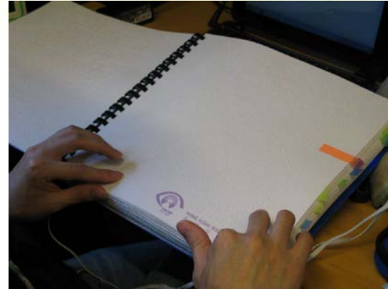
A Blind Student using his own Computer and "Reading" Reference Books