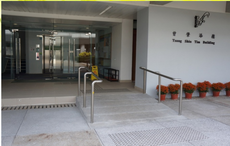
↑↓Special Bells Installed at Main Doors of Dean of Students Office & College Library